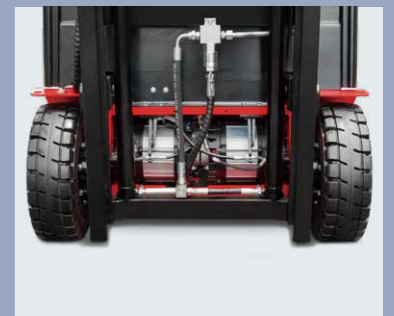
Front dual separated motors