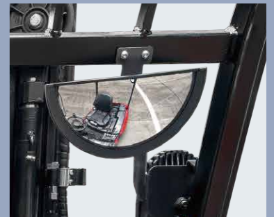
Panoramic rearview mirror