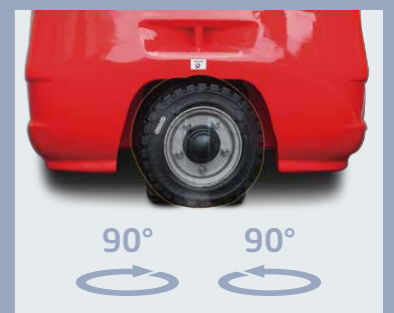
The small turning radius is suitable for narrow channel