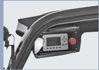
The dashboard in the driver's cab is placed overhead and can be seen when the driver lift her/his head, and the function buttons can be pressed easily