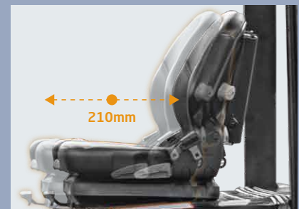
The seat can be adjusted back and forth by 210mm. The operator can choose the best driving position