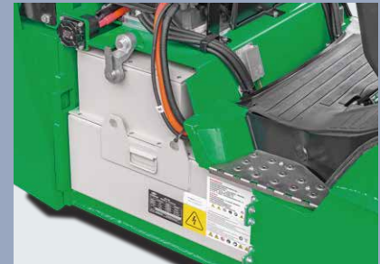
The packs can be easily removed by a manual or electric cart, and can be repaired and maintained conveniently