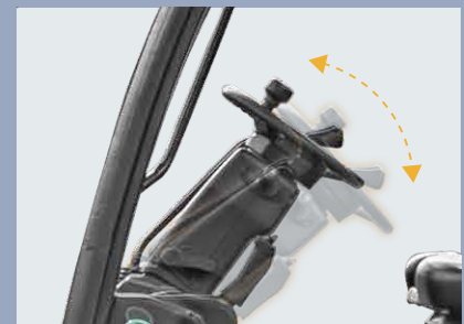
The ergonomically designed tilt-adjustable small-diameter steering wheel makes the driver feel good