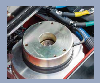
Electrical Park Brake (EPB) syste