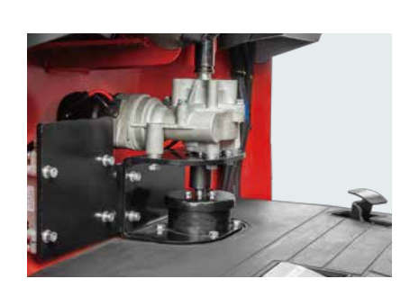
Electronic power steering system (for stand-up driving type tractor)