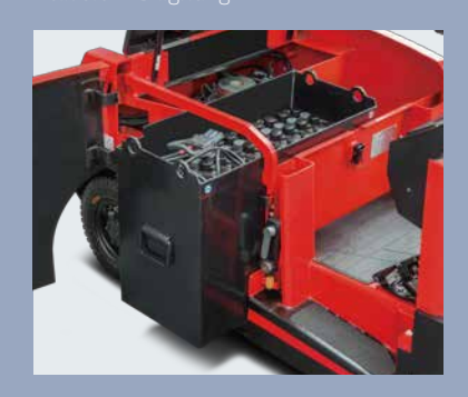
Battery side roll out is taken as the standard configuration in order to easily and fast replace the battery