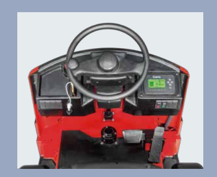
Modern outline design with LCD instrument and USB charging po