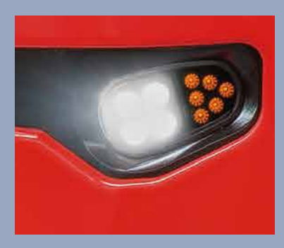
Reliable LED lighting