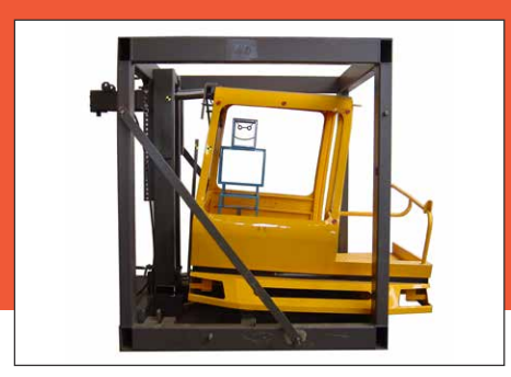
Strong, all-steel cab structure (fully FOPS and ROPS tested) ensures maximum driver protection