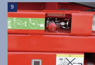
Manual lowering valve: When the operation system failed or the battery power is too low to let the platform decline, we can use this valve to lower the machine