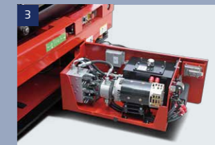
Hydraulic and electric system