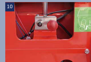
Manual release valve: When the machine can not move, you can push the machine after pressing this valve