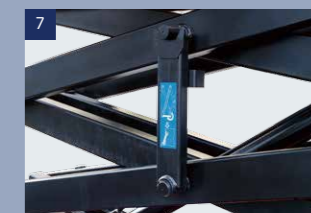
Supporting arms: To protect the operator when he is doing repair or maintenance job