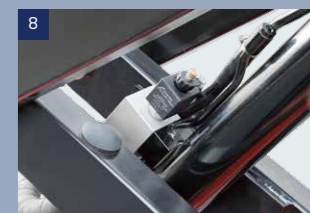
Explosion proof valve: To prevent the machine falling when the oil pipe is leaking