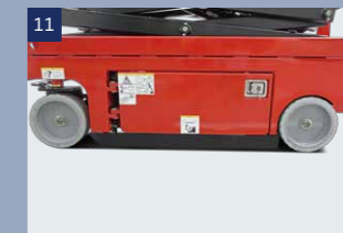
Anti-overturning system: When the machine raises to more than 2m, this system will work automatically, to protect the machine from overturning while walking at un-leveling ground